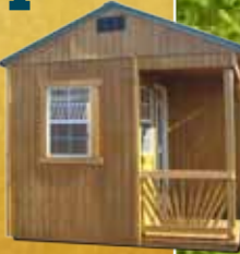
UTILITY SIDE PORCH