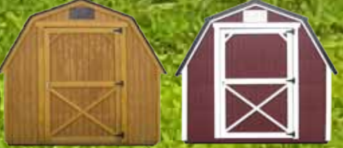
8 FT. WIDE BARN 8 FT. WIDE PAINTED BARN

*Our certified buildings are certified for 30 PSF Ground Snow Load and 90 MPH Wind. Price does not include anchors. Not guaranteed for every local jurisdiction.