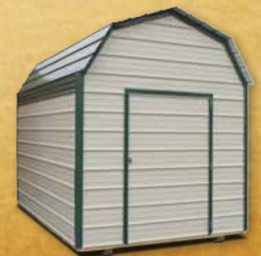
8 FT. WIDE METAL LOFTED