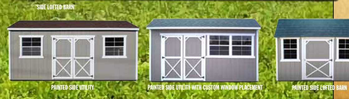
SIDE LOFTED BARN PAINTED SIDE UTILITY PAINTED SIDE UTILITY WITH CUSTOM WINDOW PLACEMENT PAINTED SIDE LOFTED BARN