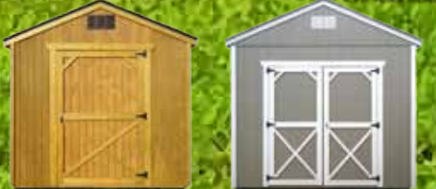
SHOWN ABOVE WITH OPTIONAL 8 FT. WALL HEIGHT

*Our certified buildings are certified for 30 PSF Ground Snow Load and 90 MPH Wind. Price does not include anchors. Not guaranteed for every local jurisdiction.