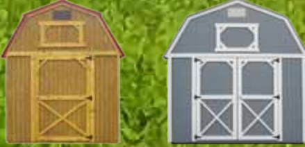
8 FT. WIDE LOFTED BARN PAINTED LOFTED BARN

*Our certified buildings are certified for 30 PSF Ground Snow Load and 90 MPH Wind. Price does not include anchors. Not guaranteed for every local jurisdiction.