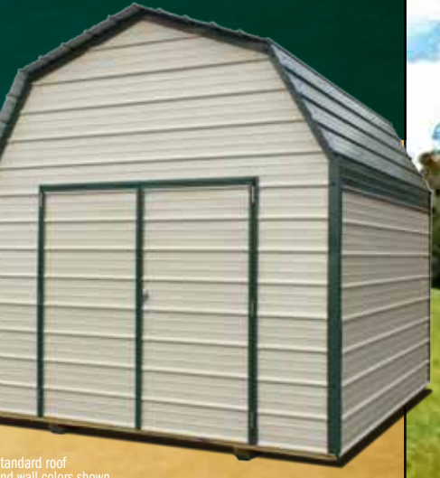
Standard roof and wall colors shown

FEATURES Spacious 6'7" Tall Walls Standard On Metal Shed & Metal Lofted